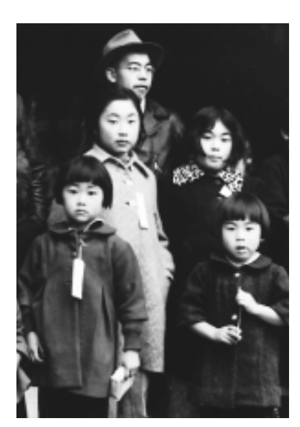
Japanese American children waiting to be evacuated from their California homes to internment camps.